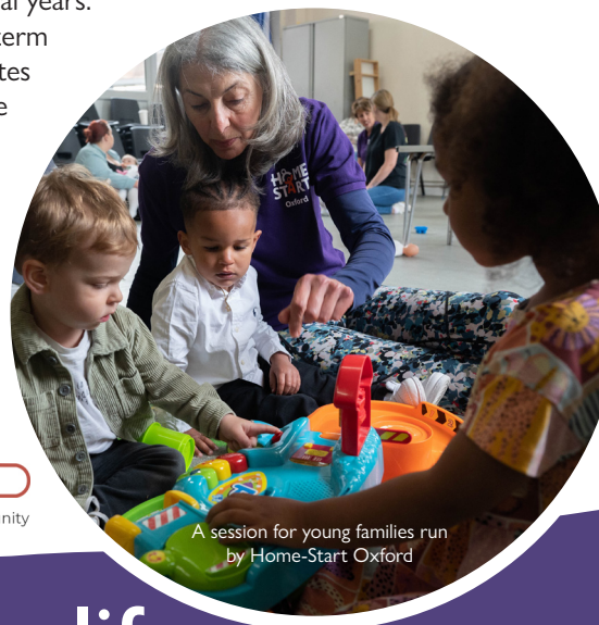
A session for young families run by Home-Start Oxford