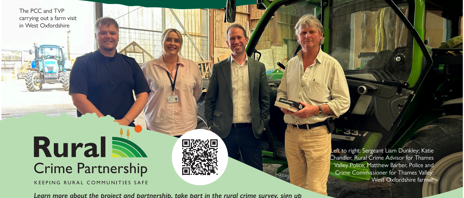
The PCC and TVP carrying out a farm visit in West Oxfordshire

If you live or work in West Oxfordshire, South Oxfordshire, or the Vale of White Horse, we want to hear from you through our rural crime survey. By sharing your insights on rural crime, you'll help us identify emerging problems and guide future strategies to effectively tackle rural crime and make our communities safer.