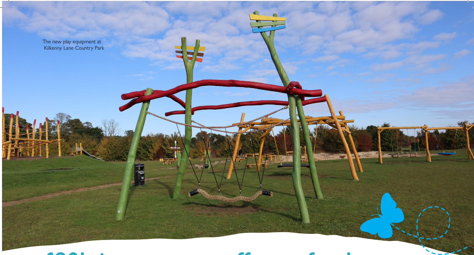
The new play equipment at Kilkenny Lane Country Park