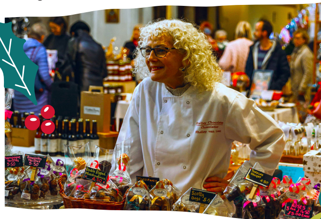
Local trader at Woodstock Festive Fayre.

On 1 December , the historic Combe Mill will host its annual Christmas Fayre from 11am to 4pm. Enjoy a festive day out with the family, complete with a Christmas market, raffle, tearoom, BBQ, mulled wine, and chestnuts. You can even watch the blacksmiths in action in the forge, making unique items for your Christmas stocking. Children can listen to a story with Santa and receive a gift, while adults explore the range of handcrafted gifts. Entry is free, with plenty of parking available, so bring the whole family—including the dog on a lead!